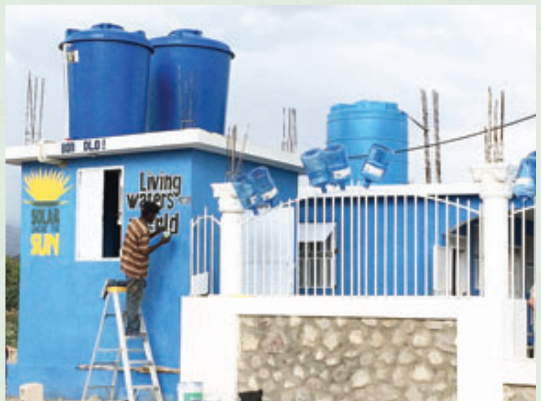
The new SUTS-LWW System is open at Myan Orphanage in Gonaives, Haiti.

Palo Duro Presbytery, TX Pines Presbytery, LA Presbyterian Women, First Presbyterian Church, Texarkana, TX Presbyterian Women, Ponca City Presbyterian Church, Ponca City, OK