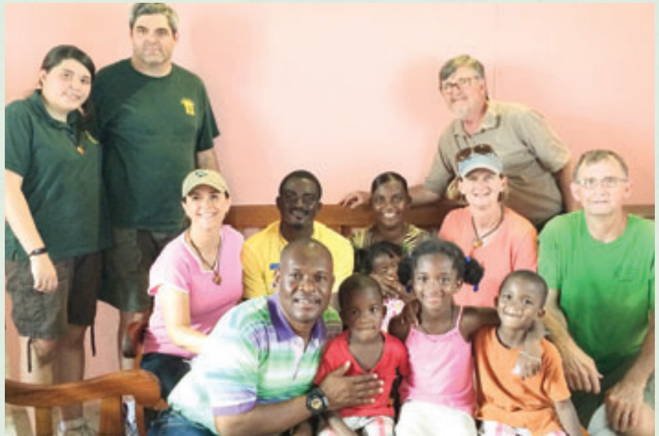
ABOVE: SUTS Leaders with Darivager Orphanage Leaders; BELOW: SUTS Graduates celebrate with Coreluv leaders