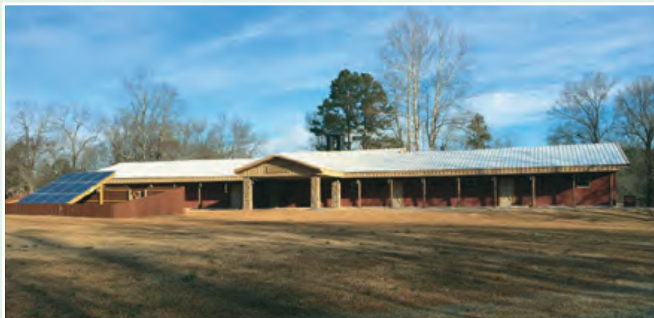
This beautiful building is ready for the next Solar School Graduates. Join us in May & September.

No home for Solar School would be complete without solar power. The whole building is powered by